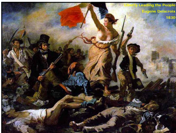
Liberty Leading the People Eugene Delacroix 1830