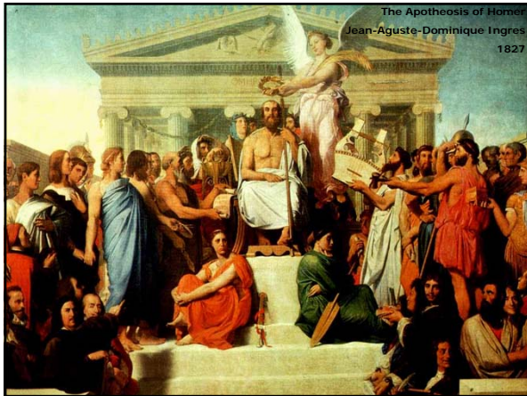
The Apotheosis of Homer Jean-Auguste-Dominique Ingres 1827