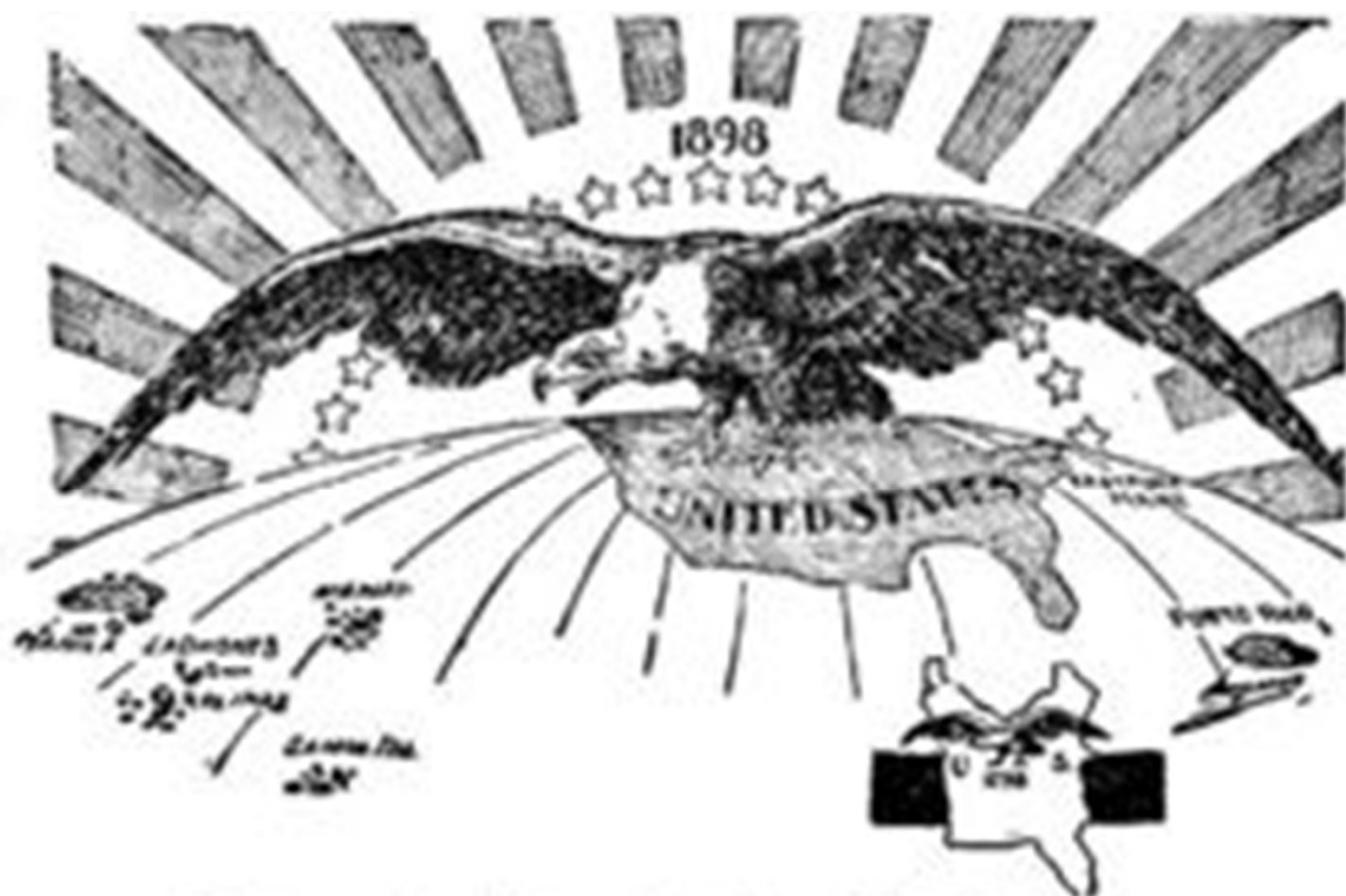
Ten thousand miles from tip to tip.—Philadelphia Press.