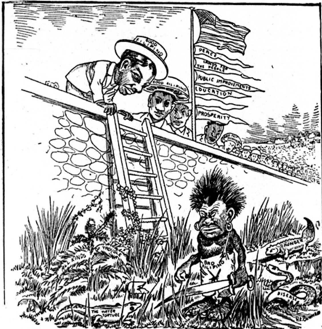
THE SENATE PHILIPPINE BILL OFFERS GREAT INDUCEMENTS TO THE BAD FILIPINO. — Minneapolis Tribune