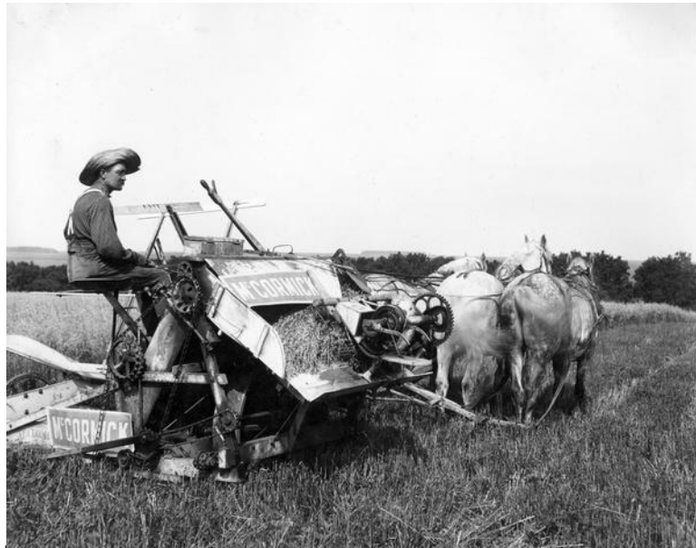
An 1890s-era tractor Image ID: 22888

It is 1892, and farmers make up 50% of the American population. New farm machinery allows farmers to produce more crops than they did in years past, but unfortunately, this increased production has caused prices of farm goods to steadily decrease. Railroads help farmers sell their products in new markets, but they also make new land accessible for farming, which in turn adds to the problem of overproduction.