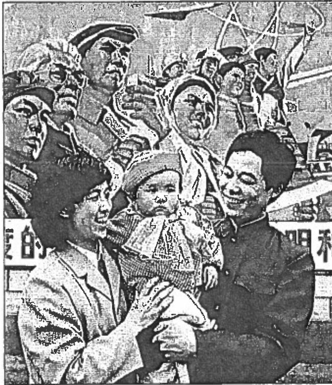
Family at Beijing Zoo.

Overview: In 1980, leaders in China feared that their nation did not have enough resources to support its huge and rapidly increasing population. To avoid what might become an overpopulation disaster, these officials implemented a far-reaching population control program called the one-child policy. The program has been revised since 1980, but after more than 30 years, it remains in place. This Mini-Q asks whether or not the one-child policy has been a good idea for China.